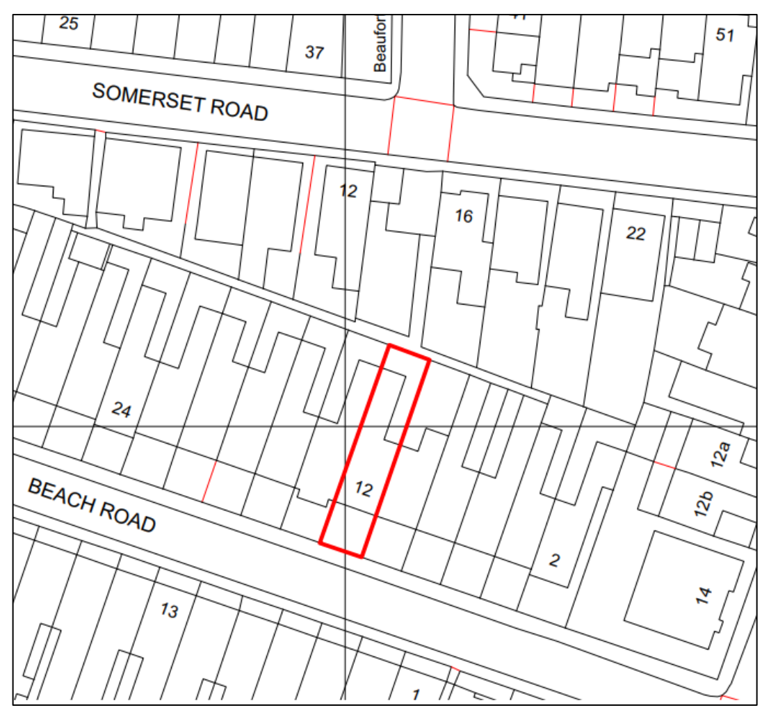
Figure 1 - Site Location Plan

2.3 The surrounding area is residential in character with two and three-storey dwellings. The southern side of Beach Road comprises two-storey red brick terrace dwellings with two-storey bays; but with some 1930s housing with some original details at the eastern end.