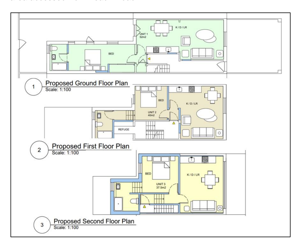
Figure 2 - Proposed Plans